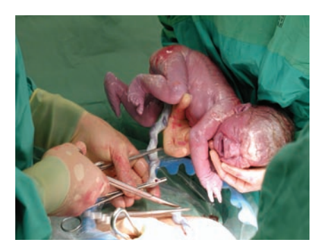
Umbilical cord blood taken from a neonate for future transplant use.

The need for a central coordinating network is also the focus of a report released April 18, 2005 by the IOM. The report recommends that a new cord blood coordinating center — similar to the existing